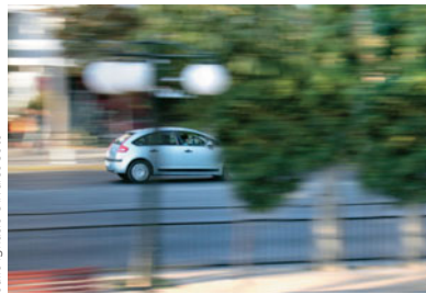
Julio Ignacio Olivares Soto